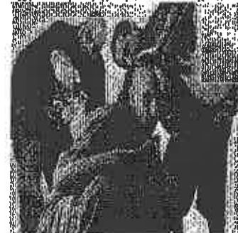
Egyptian hip-hop group Arabian Knightz.

After the uprising of 25 January, Cairo's Tahrir Square resounded to the traditional Egyptian frame drum or daf , which pounded out trance-like beats over which the crowd laid slogans full of poetic power and joyful hilarity. As the Egyptian people rediscovered what it felt like to be a nation, united and indivisible, they reverted to the raw power of their most