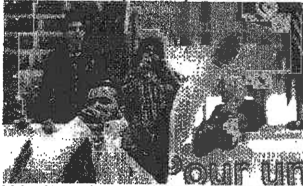
Tunisian rap singer Hamada Ben Amor, or El Général, performs at an opposition rally in Tunisia.

For years, musicians in Tunisia and Egypt were terrified of aggravating the authorities. Then a song by a little-known rapper showed it was possible to protest and survive